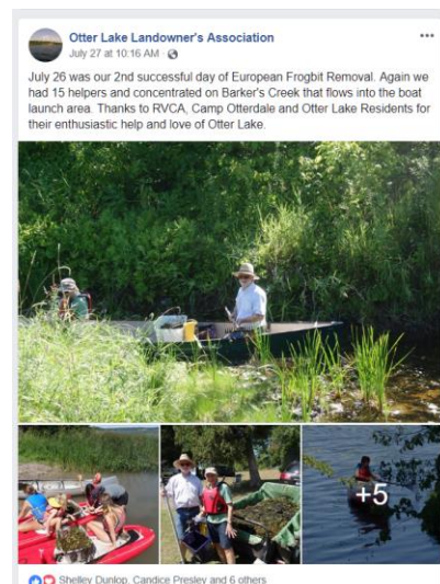
Frogbit removal at Otter Lake (Township of Rideau Lakes)

For more about FOCA's AIS Program, visit: https://foca.on.ca/aquatic-invasive-species-program/