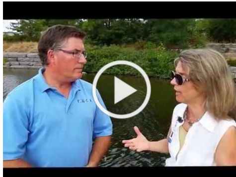
About Algae Blooms (2016)