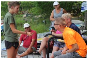
identifying Fanwort at Lake Kasshabog

The pictures and reports are starting to roll in from our 30+ on-the-ground Association initiatives in the 2018 FOCA Aquatic Invasive Species program . Congratulations to all our member groups, and your hard-working volunteers!